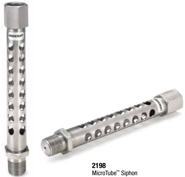
2198 MicroTube™ Siphon

Max Allowable Working Pressure: 5,000 psi at 800°F (427°C)